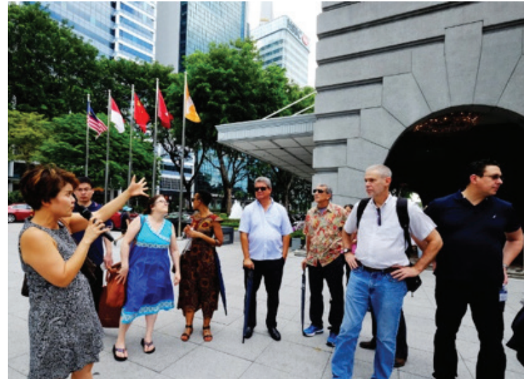
Conference participants visit Singapore's Marina Bay, which strategically combines urban development, public space, and water security (left), and the Singapore City Gallery, which provides residents with snapshots of the city's past and planned future transformation (right).